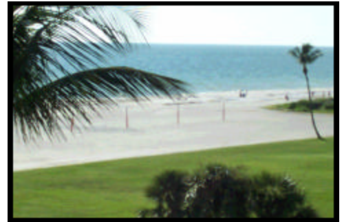
FES Annual Meeting, Marco Island