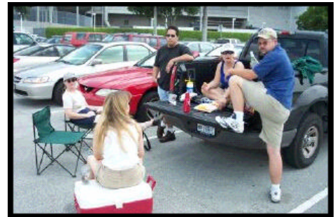
FES Marlins Tailgate "Networking"